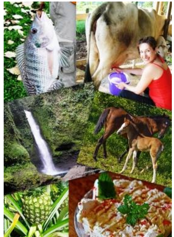
Finca Rio Perla Activities

After dinner and a Havdalah ceremony under the stars, we can get into the mood by watching a rainforest themed film, or taking drinks and playing pool in the Stablo – the old stables converted to a chill out area.