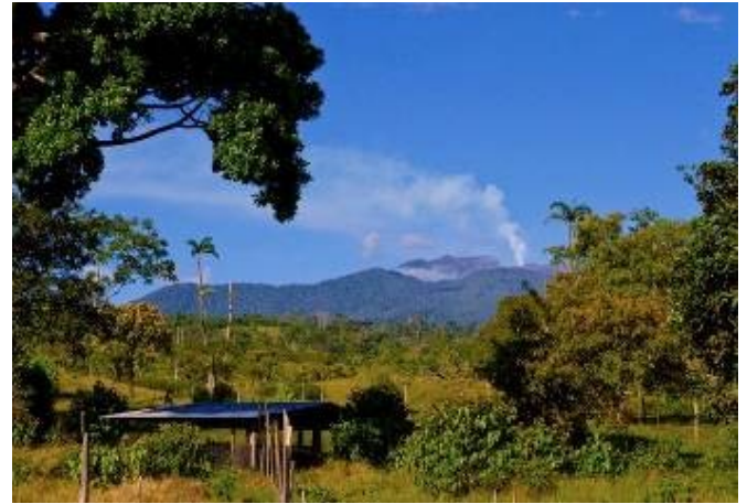
A view of Volcan Turrialba from Finca Rio Perla

***Please note that the time and location of an activity might change due to unexpected circumstances, such as inclement weather and hazardous road conditions.