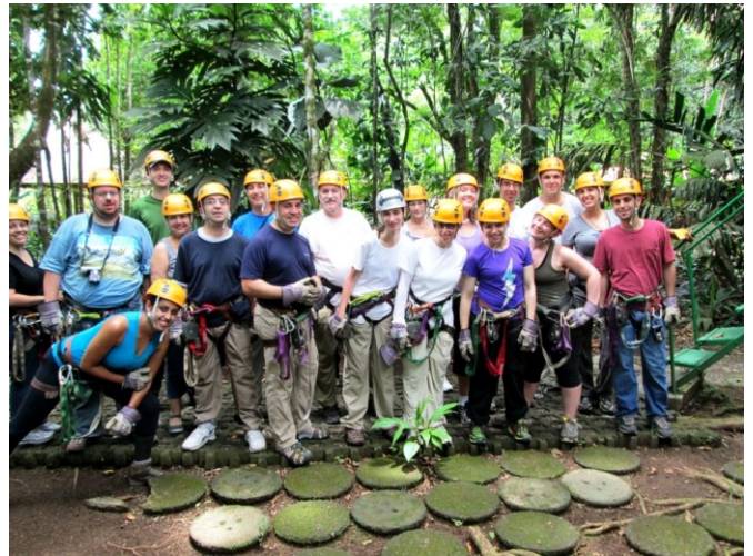
Zipline adventure in the jungle!

The 9 day Summer Costa Rica Caribbean Experience for Young Jewish Professionals (for singles in their 20s - mid 40s) this Summer offers a diverse adventure that combines the Caribbean Highlands of Costa Rica – with its breathtaking tropical beaches. It begins by visiting the capital San Jose and the local Jewish community, after which we go on an amazing whitewater rafting run down to the Caribbean Lowlands, with their tropical beaches, unique flora and fauna, active nightlife, and indigenous culture - where we will also participate in a day of service benefiting one of the communities; it continues with a visit to Tortuguero National Park, with its majestic jungle canals and the late-night ritual of endangered turtle nesting on its beach; and it ends in the highlands, with their lush mountainous rainforest, waterfalls, freshwater pools and serenity - spending Shabbat while based at a cool Jewish owned eco-farm on the slopes of Volcan Turrialba.