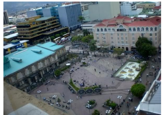
Downtown San Jose

During the afternoon, we will be able to explore San Jose – we will be staying about a mile west of downtown, and it should be a nice Shabbat walk to some of the main attractions, such as the Plaza De La Cultura, the National Theater and the National Museum.