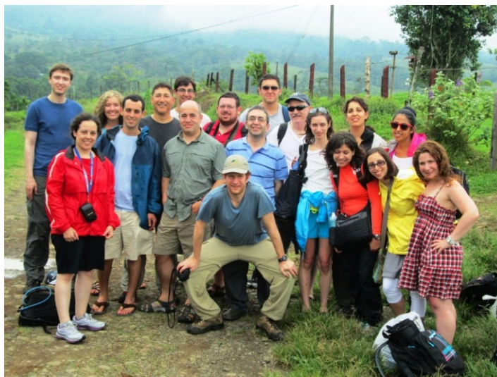
August 2012 group on Finca Rio Perla