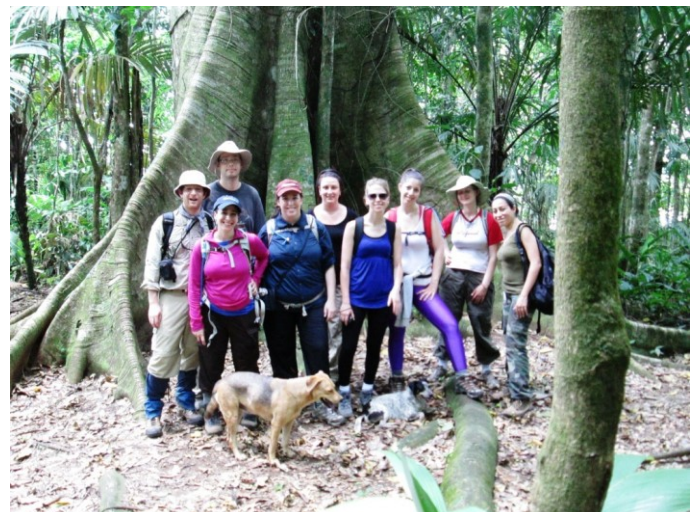
Hiking the Gandoca-Manzanillo Wildlife Refuge

The early wake up this morning will take us on a half day hike in the amazing Gandoca Manzanillo Wildlife Refuge – one of the best trips for wildlife viewing in all of Costa Rica.