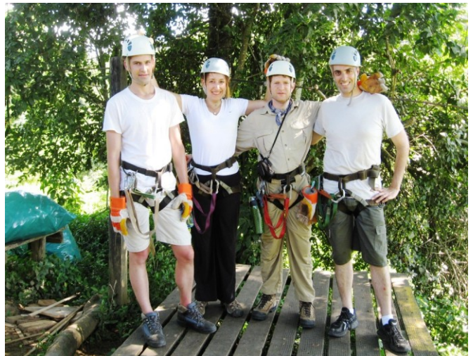
Tour participants on the Jungle zipline

We will take a ride up the coast to the historic port of Limon, where we will eat