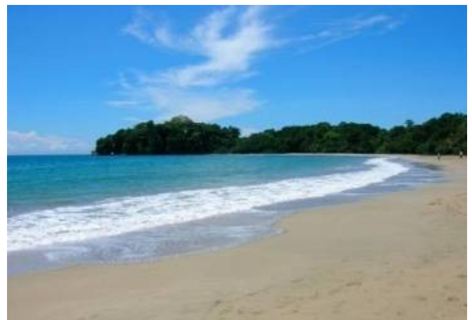
Punta Uva Beach

Other options: Rent bicycles and tour the beaches, take a surfing lesson, go to the local butterfly or botanical gardens!