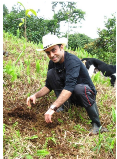
Planting a tree on the farm

After our long day, we will sit down for our festive Shabbat meal – a traditional Tico vegetarian dinner, including the tilapia we fished as well as freshly baked challa and some local wine. Dinner will be followed by a free evening to read, drink, play games and fall asleep to the sounds of the jungle around us.