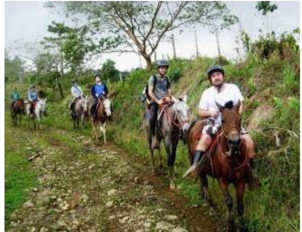
Horseback riding on Finca Rio Perla

Our orientation tour will be followed by a fresh home-cooked veggie lunch, after which it is time to saddle up! From the stables you will leave on a horseback ride towards the upper area of the farm. You will leave the horses near the macadamia processing shed, take a tour of the macadamia plantation, taste some fresh sugarcane, and hike down to the big waterfall (over 100 ft!). For nearly two hours you will take a swim in the cool water at the fall base and enjoy the rainforest around you. You can climb a small waterfall and go swimming right under the big one - an amazing experience! On the way back you will seek out some pipa's (water filled coconuts) to open for a refreshing drink.