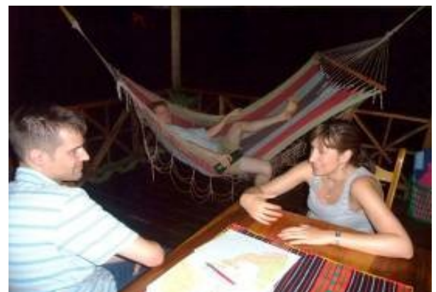
Chilling on the deck of the main house (Posada) of Finca Rio-Perla