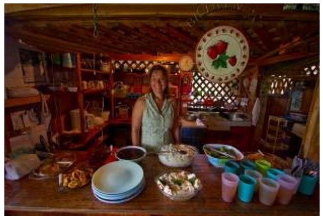
Delicious veggie breakfast on Finca Rio Perla