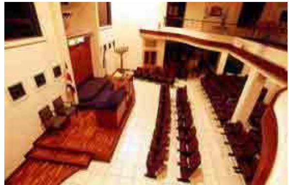
Congregación B'nei Israel San Jose

After landing, you will be taken to our hotel, Apartotel Cristina , where we will be staying the next two nights. You might have time to rest a bit and explore downtown San Jose (depending on when you land), before heading to services and Kabbalat Shabbat, and a communal dinner (oneg) at the Congregación B'nei Israel , the liberal synagogue (affiliated with both the Reform and Conservative movements).