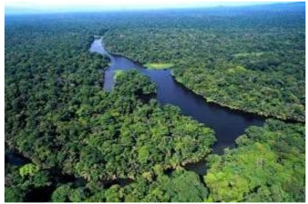
Tortuguero national park

Early Morning Canoe Tour: In the early hours of the morning you will be woken up by a loud noise. What you will hear is not a trumpet or a big bell, but a natural alarm called the Howler Monkey! Drink some coffee and get ready for a very early boat ride. This is the best time to find wildlife along the majestic canals while admiring the beauty that is the Tortuguero National Park. Among the common species of fauna to be found are the howler, white-faced Capuchon and Spider monkeys; crocodiles; iguanas; and the blue heron, aningas, kingfishers and other type of birds. If we look closely, we may see a manatee or the Gaspar fish (considered a living fossil).