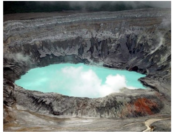
The Poas Volcano Crater Lake

The Poas Volcano, a National Park, reaches to the height of 2,300 meters above sea level. It is an active volcano with a beautiful blue crater lake at its summit, located amidst alpine cloud forest. After getting to the park early, visiting the summit and (weather permitting) viewing the active and dormant craters, you will visit the Doka Estate , a coffee plantation, where your guide will explain a bit about the coffee crop, its cycle and its importance to Costa Rica.