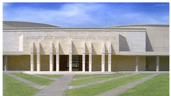
Shaarei Zion synagogue in San Jose

For more info, please read this Hadassah article , this virtual tour , and this article from Haa'retz for more info about the Jewish Community in Costa Rica.