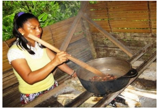
Traditional chocolate making at the BriBri reservation

Next we will visit an indigenous family where they make chocolate from the Cacao trees growing beside their house. You will learn and see demonstrated the process by which the cacao fruit is transformed into delicious and unique chocolate. You will have an opportunity to purchase some chocolate or other indigenous made handicrafts here. Note that part of the family speaks very limited English so if you don't speak Spanish your explanation of the process may take the form of a pantomime!