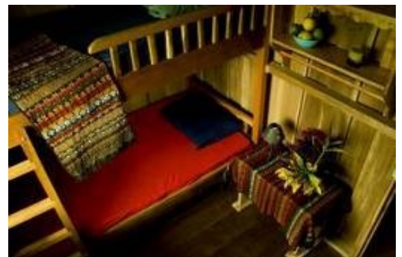
Bunk room on Finca Rio-Perla