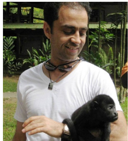
Tour participant with young howler monkey at the Jungle Rescue Center