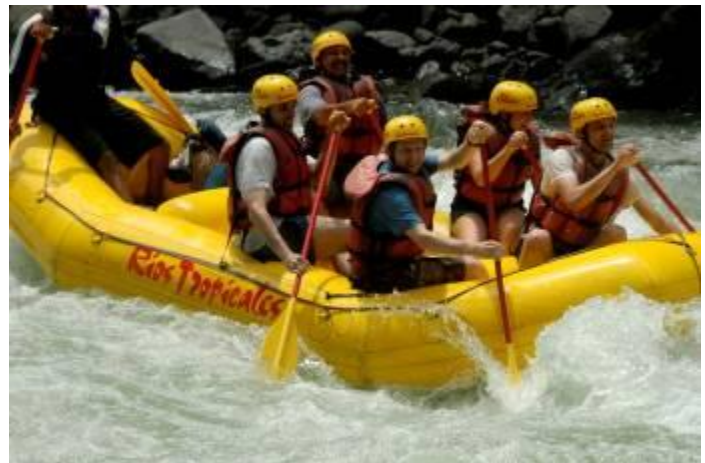
Four participants rafting on the Pacuare River – what an experience!

A big breakfast and hearty lunch will be served at the company's operation center before and after the trip. When we are done, it's time to be drive to Puerto Viejo on the Caribbean Coast.