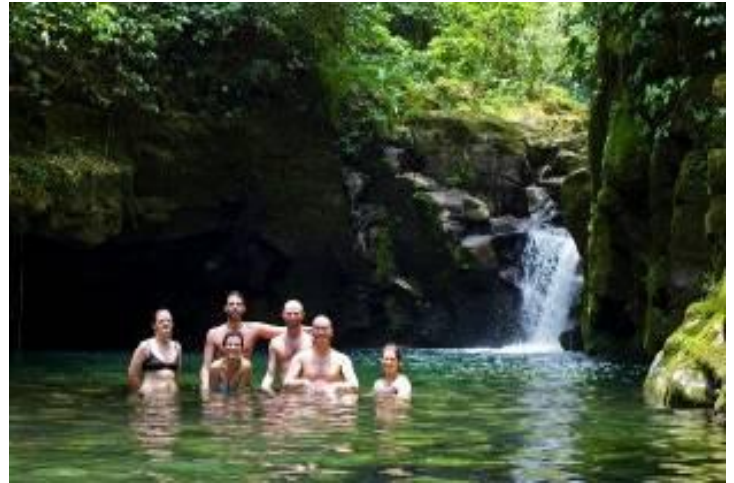
Chilling in the natural pools of Finca Rio-Perla

The 8-night Spring Costa Rica Caribbean Experience offers a diverse adventure that combines the Caribbean Highlands of Costa Rica – with its breathtaking tropical beaches. It begins by sampling some of the color that San Jose, the nation’s vibrant capital has to offer; continues with a whitewater rafting run down to the Caribbean Lowlands, with their tropical beaches, unique flora and fauna, active nightlife, and indigenous culture; continues with a visit to Tortuguero National Park, with its majestic jungle canals and the late-night ritual of endangered turtle nesting on its beach; and it ends in the highlands, with their lush mountainous rainforest, waterfalls, freshwater pools and serenity - spending the time based at a cool eco-farm on the slopes of Volcan Turrialba.