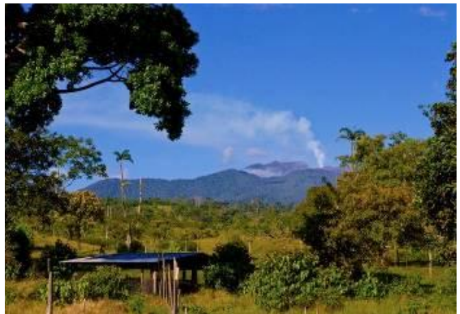
A view of Volcan Turrialba from Finca Rio Perla

If you want to arrive a day or many early, or choose to leave later, please let us know how we can help you experience more of this magnificent country. Day trips from San Jose include the nearby volcanoes of Poas and Irazu. If you are interested in this option, please let us know!