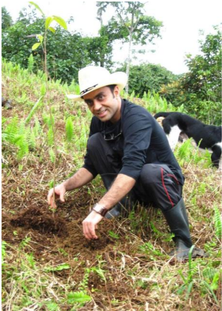
Planting a tree on the farm

In the afternoon we will have time to do as many of the following as each of us chooses: