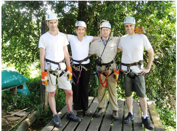
Tour participants on the Jungle Canopy Tour