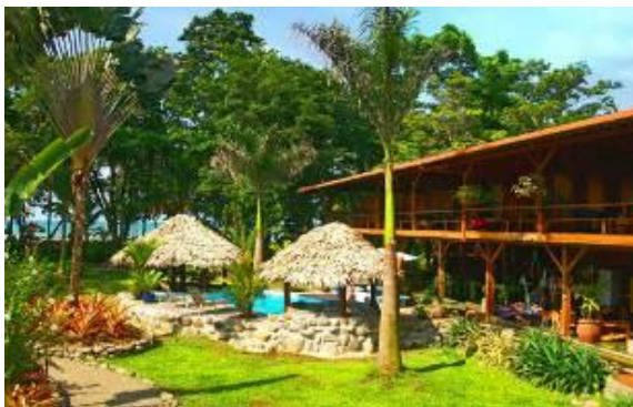
Banana Azul Hotel, Puerto Viejo

On the southern Caribbean coast we will be staying in a comfortable mid-level hotel, such as the elegant Banana Azul , or the Shawandha . We will be pairing up to share the rooms, though you might choose to be in a single room for an extra fee (if you are interested in this option, please let us know).