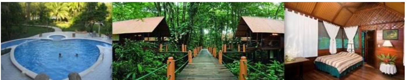
The Evergreen Lodge, Tortuguero

The Tortuguero National Park is one of the most varied parks in Costa Rica. It boasts high rainforests, marshy lands, long stretches of beach, and wide open canals perfect for crocodile spotting. It is also one of the most important breeding grounds for the Green Sea Turtle. The wildlife here is rich and diverse with unusually large populations of monkeys, birds, and fish.