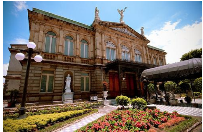
The National Theater in downtown San Jose!