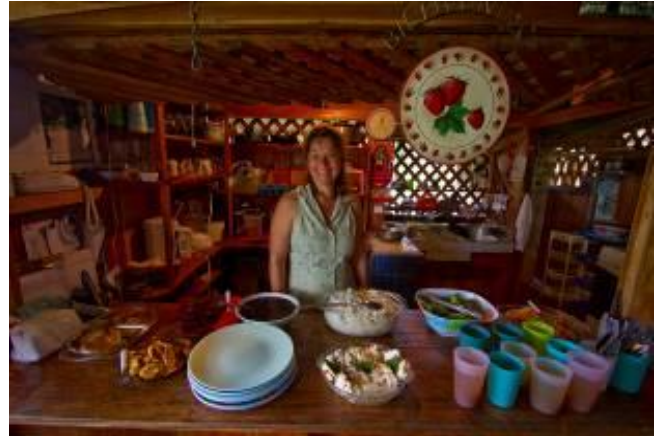
Delicious veggie breakfast on Finca Rio Perla