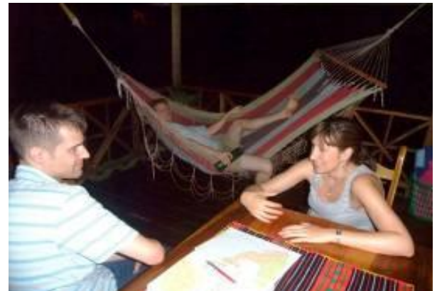
Chilling on the deck of the main house (Posada) of Finca Rio-Perla