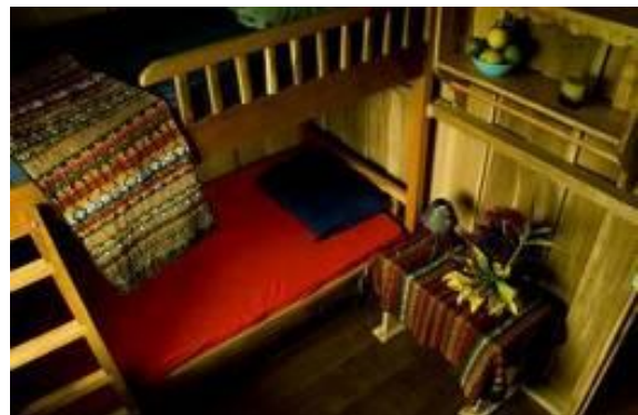
Bunk room on Finca Rio-Perla