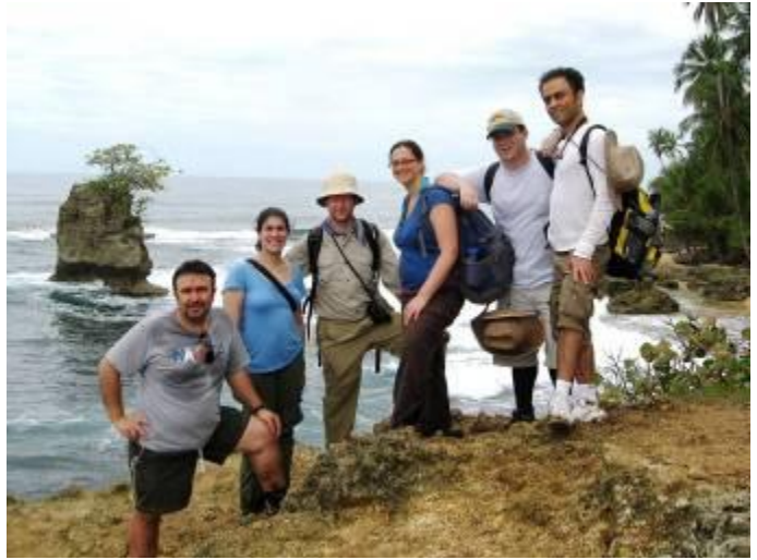
Hiking the Gandoca-Manzanillo Wildlife Refuge

The early wake up this morning will take us on a half day hike in the amazing Gandoca Manzanillo Wildlife Refuge – one of the best trips for wildlife viewing in all of Costa Rica. The hike will take us on some of the Refuge’s inner trails, or to explore the bluffs and tiny hidden beaches along the coast. It will include a walk through the primary rainforest to encounter many of its colorful inhabitants and exquisite bird watching with the local naturalist, Tino. This tour is provided by ATEC , a local nonprofit that helps promote culturally and ecologically sound tourism and small-scale, locally owned and responsible businesses in the area.